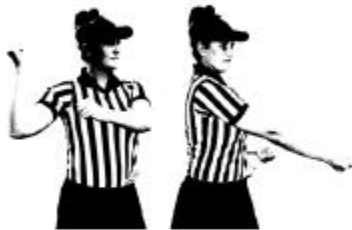
DANGEROUS FOLLOW THROUGH & DANGEROUS PROPELLING