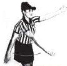
GOAL CIRCLE FOUL