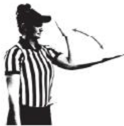
DANGEROUS SHOT ON GOALKEEPER