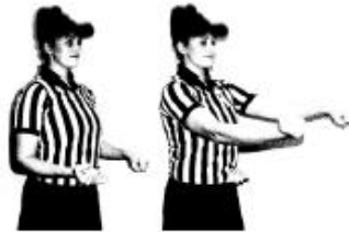
ILLEGAL STICK TO BODY CONTACT