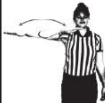
10 SECOND GC COUNT