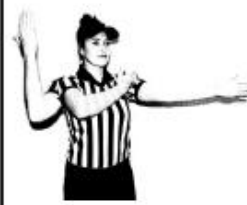
ROUGH CHECK/ ILLEGAL CHECK ON BODY