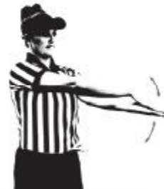
EMPTY CROSSE CHECK