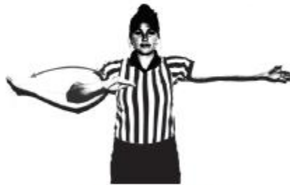
EARLY ENTRY ON DRAW