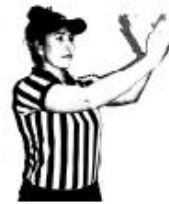
OBSTRUCTION OF FREE SPACE TO GOAL