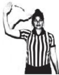
CHECKING INTO THE SPHERE