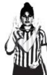
ILLEGAL CRADLE IN SPHERE