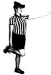
ILLEGAL BALL OFF THE BODY