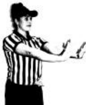
PUSHING OR BODY CONTACT